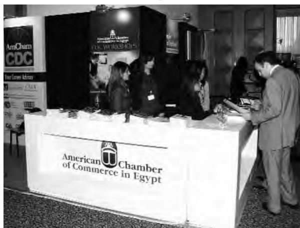
Employment Fair, December 2009